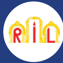
RAIN CALCINED LTD