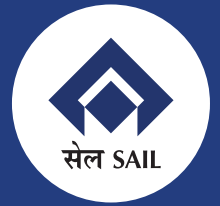
STEEL AUTHORITY OF INDIA LTD